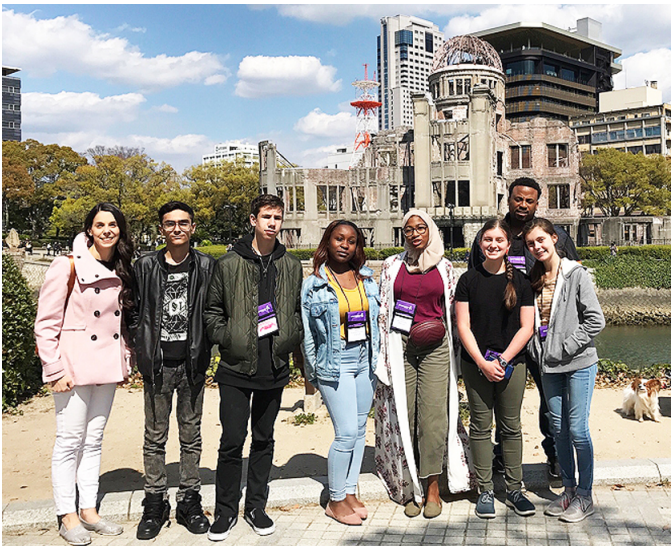
Students in Hiroshima in front of Atomic Bomb Dome