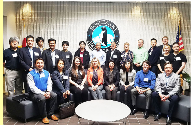
Facility Tour of Hoshizaki America on April 9