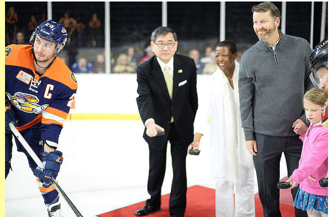
Atlanta Gladiators Japanese American Appreciation Day: The Gladiators clashed with the Greenville Swamp Rabbits in a South Division Rivalry Game! Events included live performance by Japanese drummers during the intermissions at Infinite Energy Arena in Duluth.