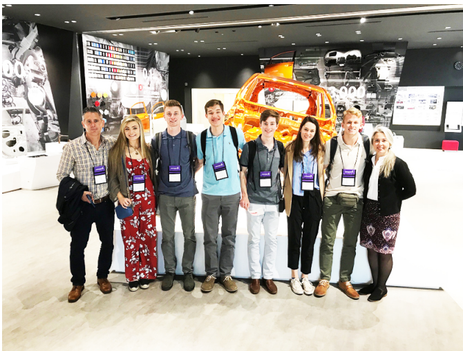
From 21 st century Japan to . . .