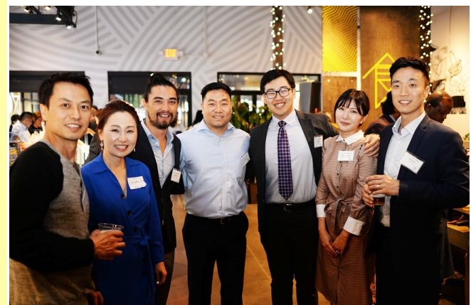
US-Japan-Korea Networking Reception on May 9