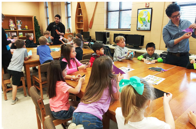
Macedonia Elementary School in Canton, Georgia on March 29