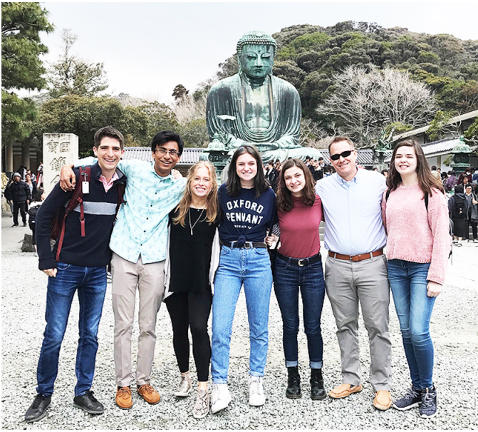
Students in Kamakura in front of the 'Big Buddha'