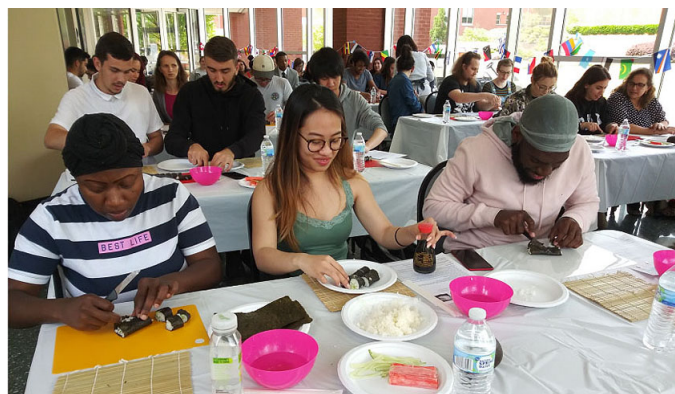
Gwinnett College language table and cooking event on April 29