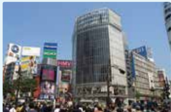
Shibuya Scramble Crossing

Fees based on double occupancy of the hotel room in Tokyo. If you prefer a single room, add $285 for 3 nights.