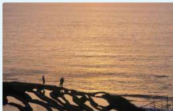
Shiroyone Rice Fields in Noto