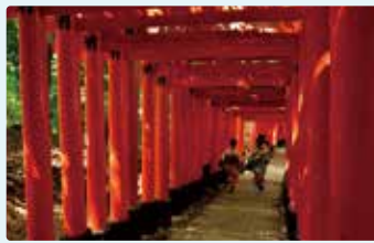
Fushimi Inari Shrine

July 15 (Mon.) Depart Wakayama City for Kyoto [ Stay at Ibis style Kyoto station Hotel ]