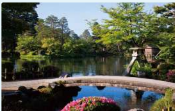
Kanazawa Kenrokuen Garden

Participation fee includes all transportation from Wakayama to Kyoto and Tokyo, admission to Gion Corner and selected Kyoto monuments, and hotel room and breakfast in Tokyo. Host family serves you meals when you are at their home. The Tokyo portion does not include a guide or personal transportation. Fees based on double occupancy of the hotel room in Tokyo. If you prefer a single room, add $95.