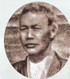
John Manjiro Nakahama