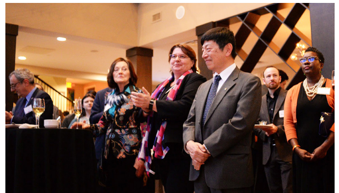
Three Consuls General attend the Sake and Wine Tasting Event in March