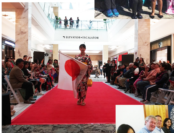
Lenox Mall International Fashion Show