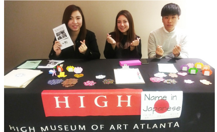
JASG Table at Kusama Film Screening in February